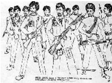
Click for full size picture. (9K)